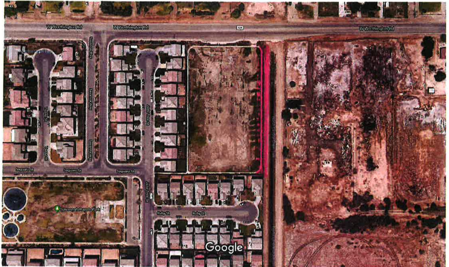
Imagery ©2019 Google, Map data ©2019 Google 100 ft