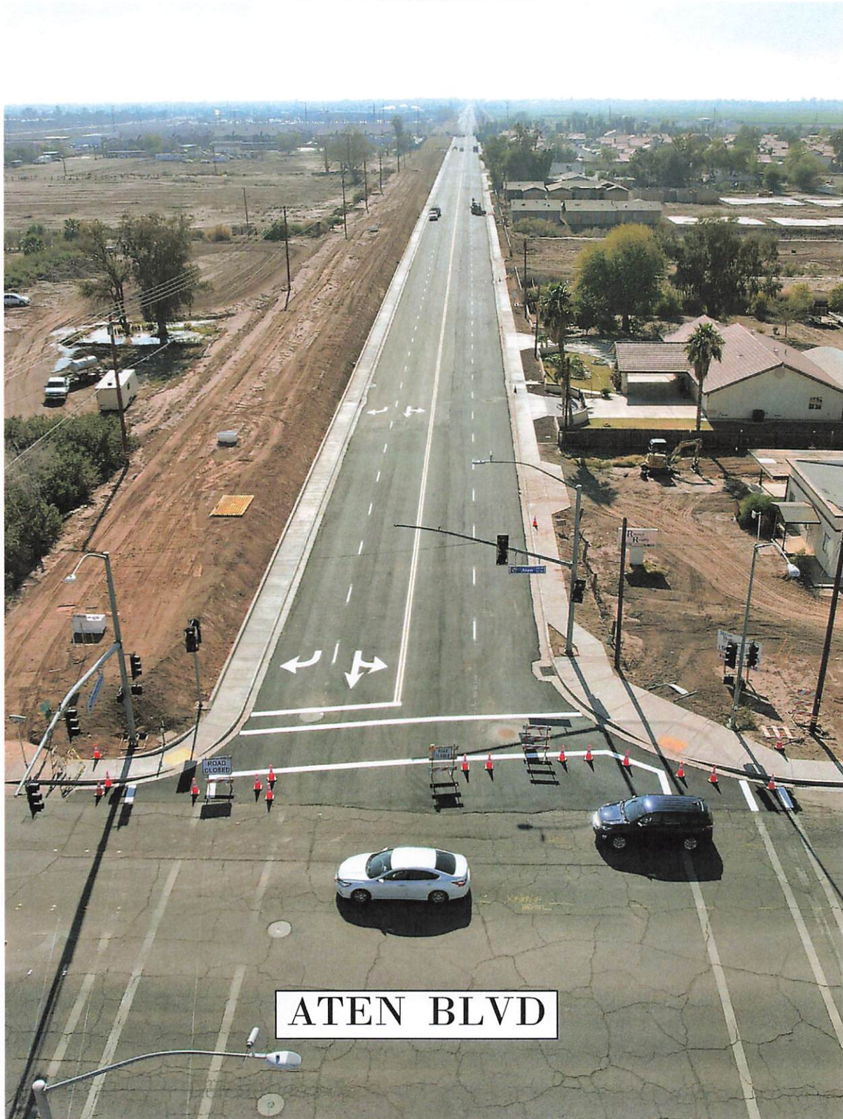
EXHIBIT 1 Photo Report LaBrucherie Widening Project from Aten Blvd to Treshill Rd