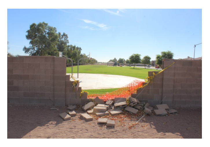
North to South – Approximately 350 feet