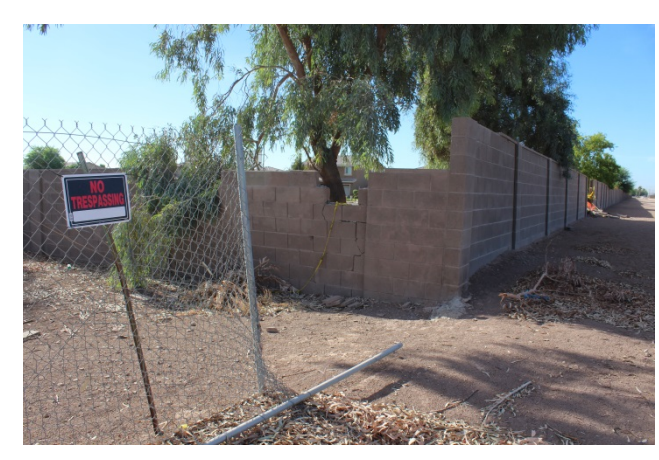
East to West – Approximately 2500 feet