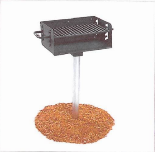
20-in BLACK CHARCOAL GRILL