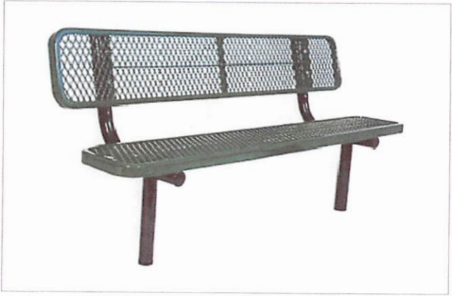
6 FT. GREEN DIAMOND COMERCIAL PARK BENCH WITH BACK