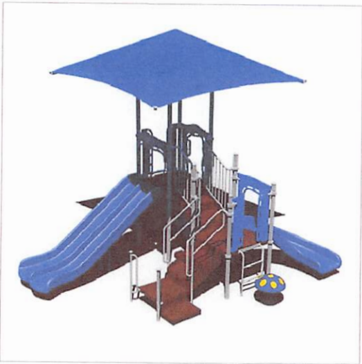
PLAYCRAFT PLAY SET MODEL R35A2 1FCB