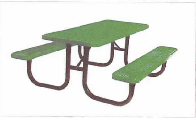
6 FT. GREEN DIAMOND COMERCIAL RECTANGULAR TABLE