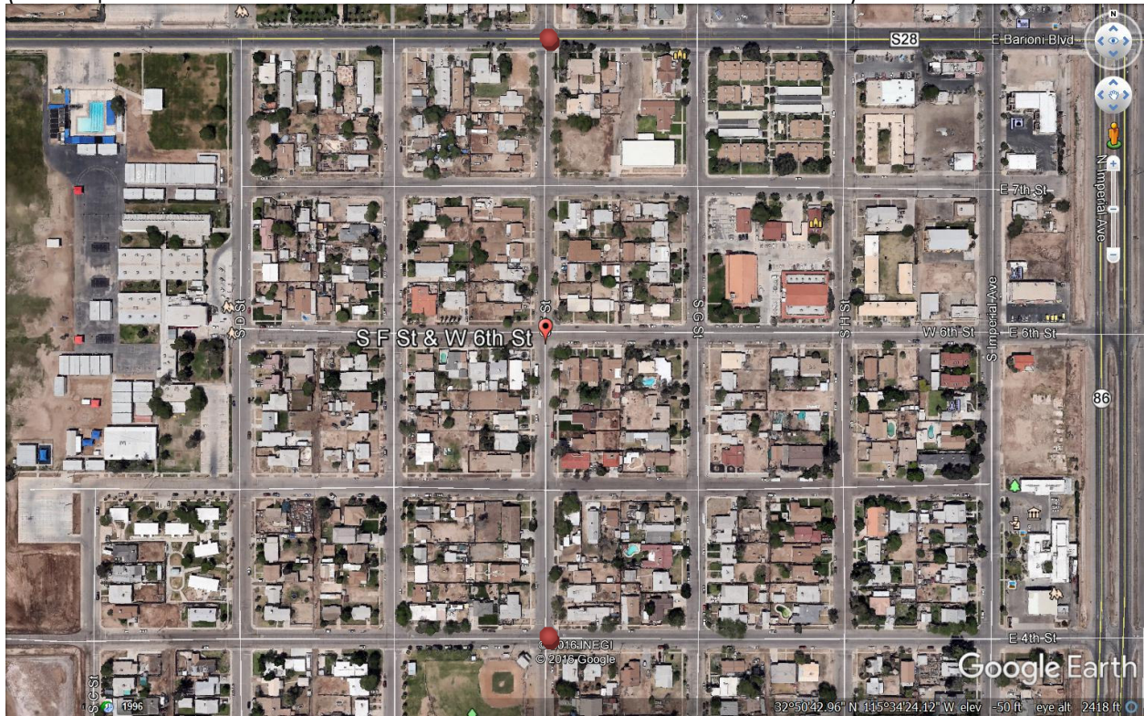
(Aerial photo of F Street between Barioni Boulevard and 4th Street)